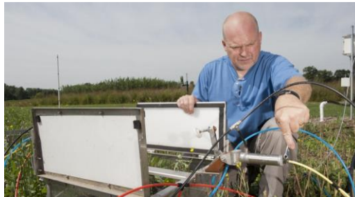
< Researcher uses automatic chambers to measure greenhouse gas emissions. Agriculture has large impact on greenhouse gas fluxes; we hope to mitigate this with improved management decisions.