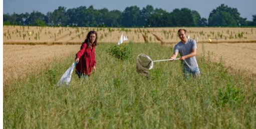
< Researchers capture insects in prairie strips within a wheat field. Prairie strips provide an opportunity to convert unprofitable areas into biodiversity hotspots that build soil health.