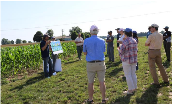
Field tours are a great way to showcase our research and get input from external partners and scientists.

Bridging the gap between the agricultural systems needed by present and future generations.